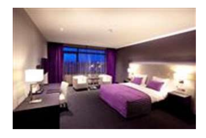
* Minimum 1 adult per room